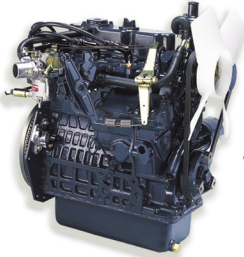
DF972 (Dual Fuel)